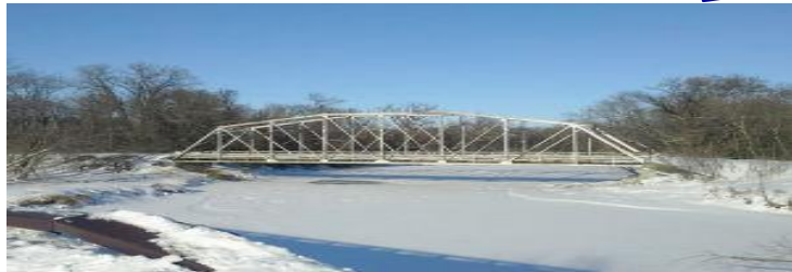
"where the path from the past & the future meet"